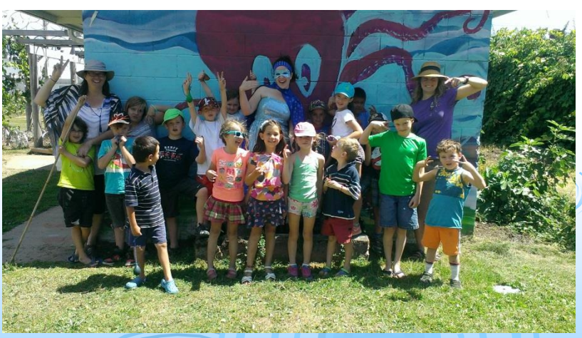
Lots more photos on Facebook: Cowichan Water Challenge